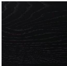
Black stained American Oak

Designed and manufactured in Melbourne, Australia.